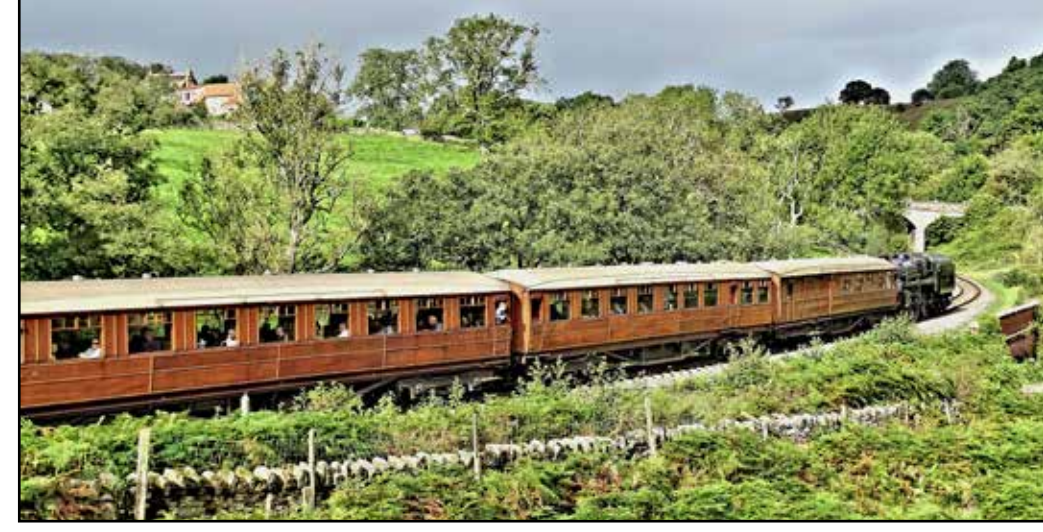
Regrettably, this sight will not be seen this year. Budget constraints and lack of funds means the LNER set will not be in use this season. On 26 September 2023, TTO 23956, RB 641 and BTO 43567 head downhill past Darnholme behind visiting Standard 4MT 75069.

part of an up-market product, particularly involving our specialist catering vehicles, namely NER TO 945, ECJS RTO 189 and GNR observation saloon 3087. They are also looking at a different sort of Agreement to the one in place which is now in its fourth year out of a ten-year period.