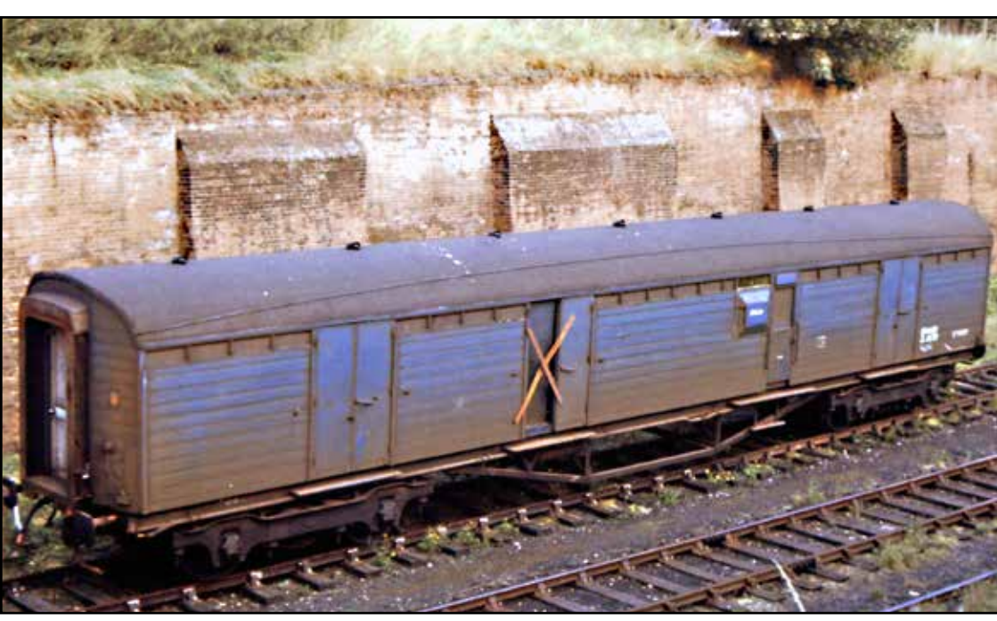
On withdrawal from revenue-earning service, 70621 became unique. Awaiting its fate - scrapping or preservation, here it is having ended its 33-year existence on the national system next to Queen Street, the lines formerly leading through the city wall into York's original station. Two of these 33 years were under the LNER regime.

at York Works, Nos. 70584 - 70636 in 1945/6.