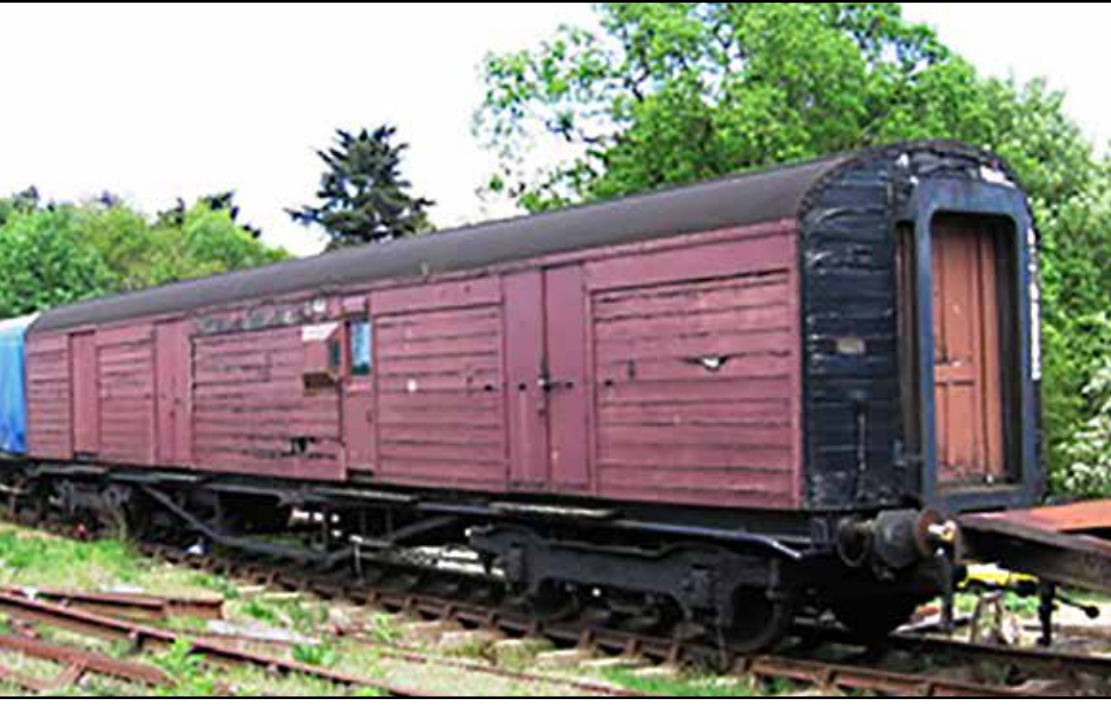
A later view of 70621 in its preservation status on the North Norfolk Railway. Because it never entered Departmental status, it remained intact. Many former LNER designed carriages had the gangway ends removed - it has never been documented why this practice was so widespread.

In 2023, the M&GNJRS managed to purchase two Gresley vehicles which had been based on the Epping & Ongar Railway, Restaurant Buffet 9118 and Brake Third Open 43556. The decision was taken to dismantle the RB for spares as it was in deplorable condition. The Brake which, incidentally, had been stored on the NYMR from 2003-2014, would be restored.